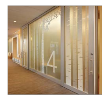
Custom graphics and field-applied film on glass provides endless opportunities for client personalization.