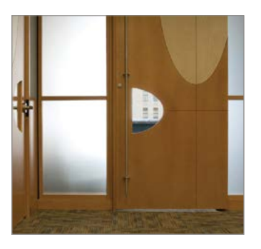
KI's own door factory supports wood, glass or a combination of substrates from basic to intricate custom designs.