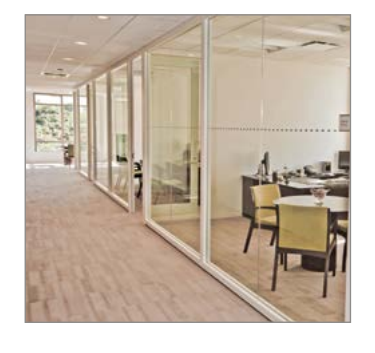
Achieve an elegant aesthetic with full-height butt-glazed glass panels.