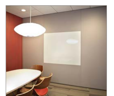
Alternate multiple panel substrates, such as magnetic markerboard painted steel recessed within full fabric shells.