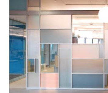
Unlimited options for custom designs such as multi-colored segmented glass give unique personality to a space.