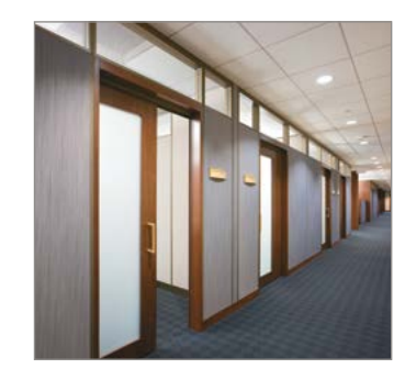
Glass transoms or clerestory windows add daylight in a space with solid fabricwrapped walls and frosted glass doors.